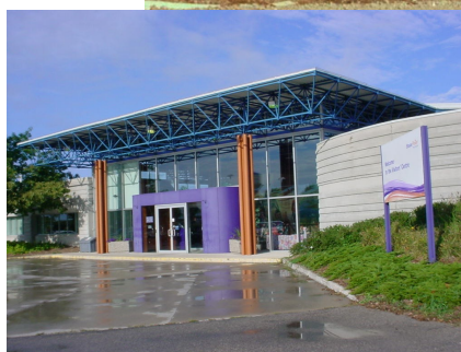
Bruce Power Visitors Centre