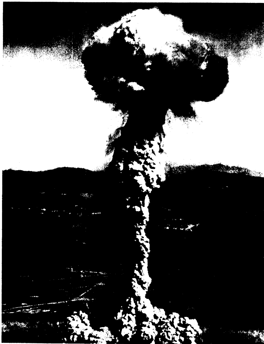
FIGURE 1. ATMOSPHERIC NUCLEAR tests, like the one shown here (XX-27 Charlie, a 14 kiloton device exploded over Yucca Flats, Nevada, on 30 October 1951), released radioactive fallout but did not lead to high average doses of radiation—even for the inhabitants of Nevada.

modynamic decay processes and by reactive free radicals formed by the oxygen metabolism. Each mammalian cell suffers about 70 million spontaneous DNA-damaging events per year. 8 Only if armed with a powerful defense system could a living organism survive such a high rate of DNA damage.